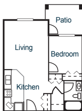
1 Bedroom 589 Sq.Ft.