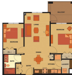
2 Bedroom 828 Sq.Ft.

Our Vision - We enhance lives by providing quality care and self-sustainable living through innovative leadership.