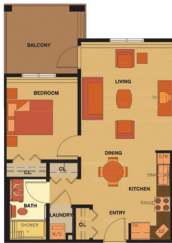
1 Bedroom 645 Sq.Ft.